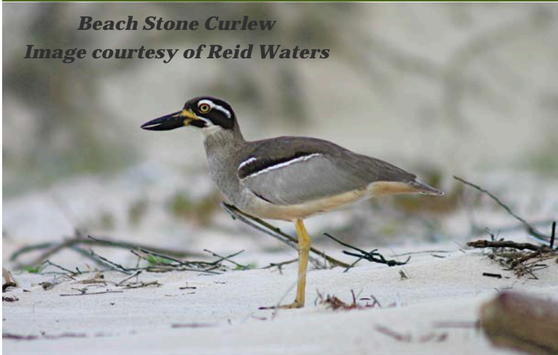
Beach Stone Curlew