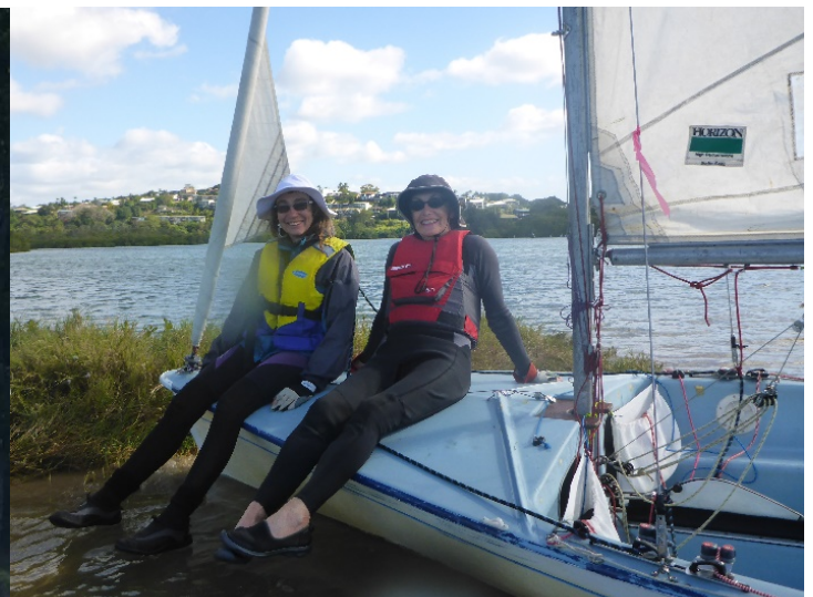
Left: 3 June winning corsair Minnow