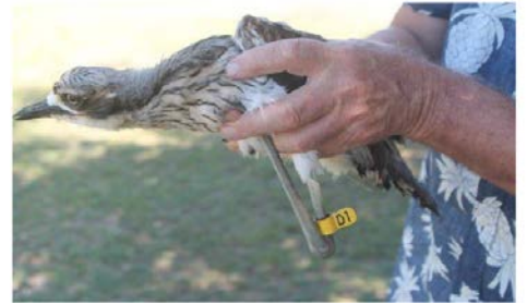
Bush Stone Curlew D1 from Fingal Holiday Park

BirdLife Northern Rivers has been successful in obtaining funds to flag shorebirds at Fingal Head. Bush Stone-curlews will be flagged to monitor their movements and survival. The flag is placed above the knee and is uniquely identified with a letter followed by a number. Seven Bush Stone-curlews from Fingal Head have been flagged. We now know that two young birds flew 20 kilometres to Pottsville and one of these was also observed in Cabarita. Its great to have funds to continue such tagging to help us better understand the Bush Stone-curlew's movements and survival.