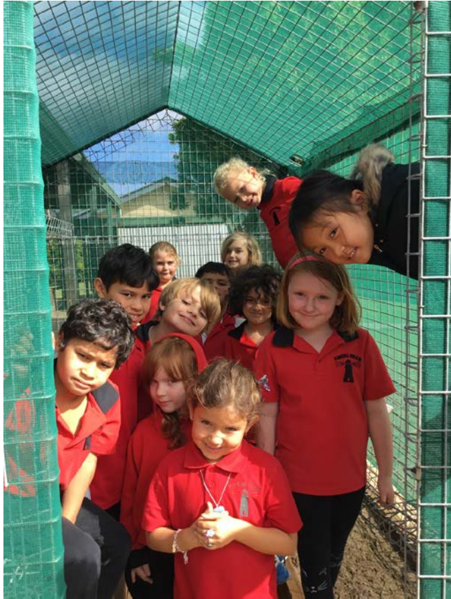
K/1/2 students love our new greenhouse.

At the moment we are interested in the tomato plants growing near our greenhouse. We think we can see the life cycle of how tomatoes grow. Are we right?