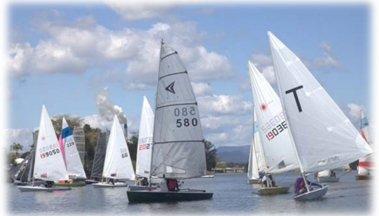
Tumbulgun Passage Race Fleet 9 September 2018

An early morning start for sailors and support team at Condong - rigging boats and providing breakfast for everyone. It was rewarding to see more spectators than ever along the river bank, especially at the Tumbulgun bridge - it's not often you see 23 sails coming down the Tweed River together. See the club's FB page and website for photos. The first boat finished in just over 3 hours and the skipper that spent the longest time sailing, 4hrs 12 mins, earned the "Golden Bailer" award (full of chocolates).