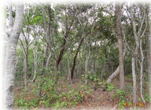
Littoral Rainforest at Fingal Head 2017