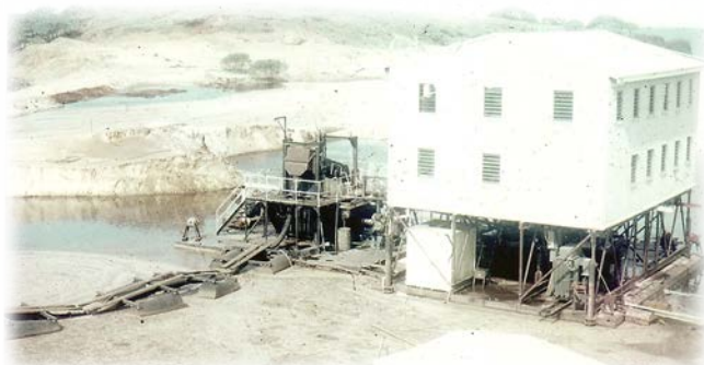
Sand mining settling pond, south of the Headland, circa late 1960s