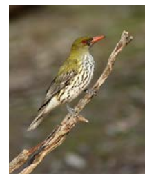
Left to right: Eastern Spinebill, Lewin Honeyeater, Noisy Friarbird, Blue Faced Honeyeater, Olive Backed Oriole